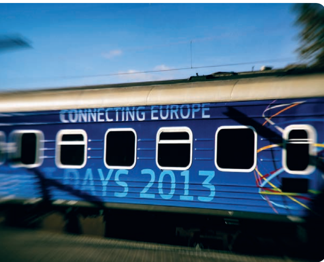
Participants jointly travelled on the conference train from Riga to Tallinn.

Around 1000 stakeholders in European transport policy met in Helsinki, Riga and Tallinn for discussion and networking on 15-18 October 2013. Prior to the main event in Tallinn, a meeting on the "motorways of the sea" started out in Helsinki and the Rail Baltica/Rail Baltic in Riga. The participants joined the conferences on the train (Riga-Tallinn) and on the ferry (Helsinki-Tallinn), and made their journey to the main conference event in Tallinn.