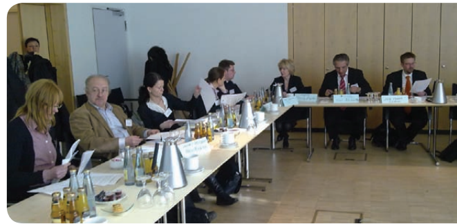
Participants of the pilot cluster workshop in the premises of Landesvertretung Schleswig-Holstein in Berlin

Participants of the first workshop talked mainly about the project outputs they could promote together. They also tried to define joint dissemination strategy and precisely characterize their target groups. During the workshop it was visible that several projects work on renewable energy sources whereas others focus rather on efficient use of energy. Still, the participants concluded that their common concern is how to convince policy makers to implement concepts proposed by their projects. To make full