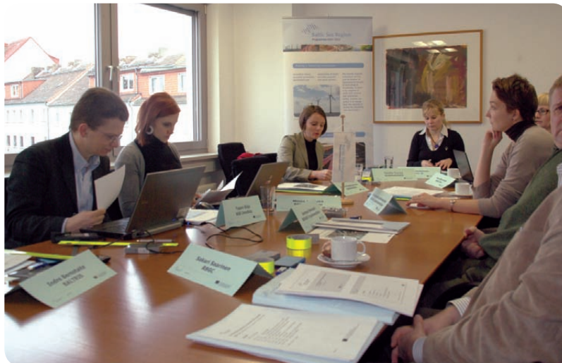
Participants at the Communication Seminar in the premises of the JTS in Rostock

On 22 February the communication managers of ten projects approved last year gathered at the office of the Joint Technical Secretariat in Rostock. All participants are facing the same challenge: how to communicate the complex results of a transnational project with a fairly small budget?