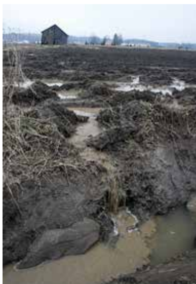
Sediment and nutrient leaching from a high risk field.

The P-index is often considered to be a cost-effective tool to reduce P leaching. This empirical model emphasizes different risk parameters to form a combined risk factor number, which can be used as a guiding factor when selecting practices and policies that reduce P leaching both at a field and catchment level. The major challenges include lack of data such as soil P status.